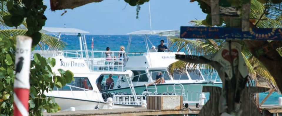
Brac Reef Divers, Cayman Brac