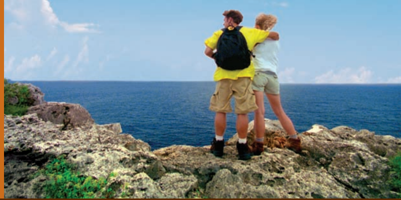
Hiking – Eastern Bluff, Cayman Brac